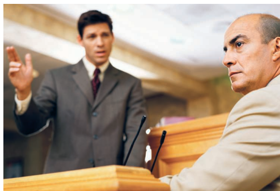
Confidence ratings. Why does a witness’s expressed level of confidence, when giving testimony, affect our judgement of its accuracy?

In other words, high type 2 performance indicates a close relationship between the confidence of the subjects and how accurately they identify the stimulus.